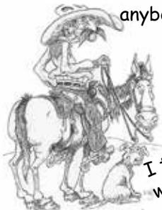
Chuck - Can't see anybody do you?