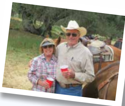
I thought they were following us

"We hang the petty thieves and appoint the great ones to public office" Aesop 620 BC