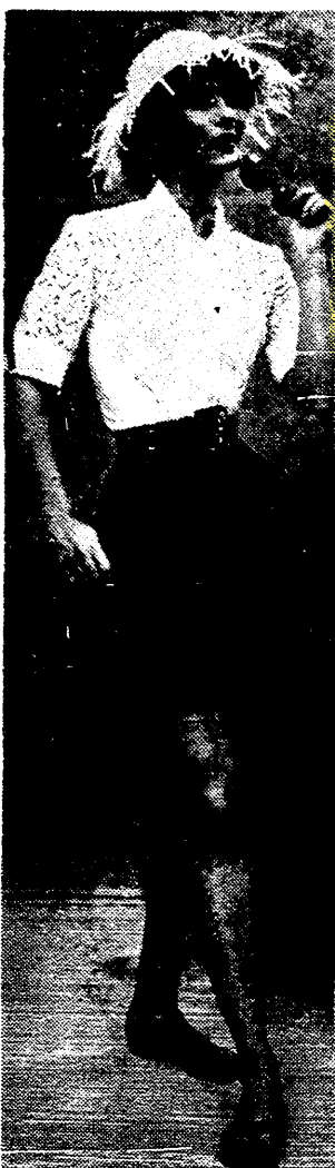
Machine-made lace turns up as button-down shirt to wear with shorts.

For the vacation traveler lace has its advantages too... it's packable and adaptable to any vacation attitude, from the dude ranch to the French Riviera.